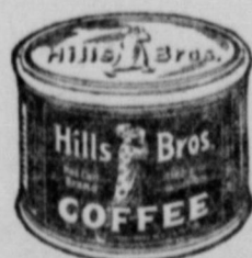
In the original Vacuum Pack which keeps the coffee fresh.