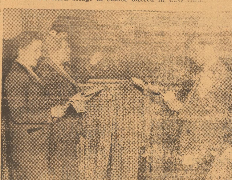
Teacher at USO helps GIs with conversational German.

rany USO clubs today and are winning enthusiastic GI approval.