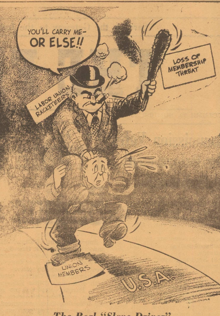
The Real "Slave Driver"

this personally. I shall always strive to merit the confidence and