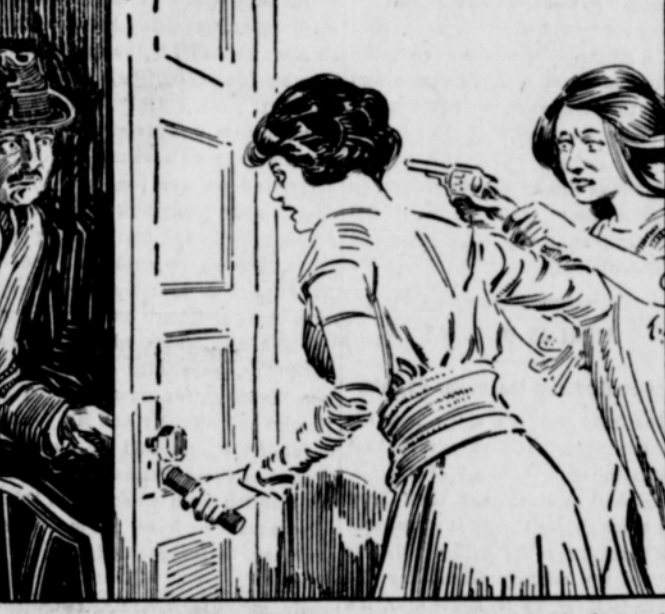
She Was About to Address Him When Her Arm Was Violently Clutched