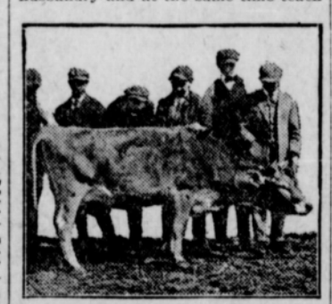
lect Good Milk Producers.

(Prepared by the United States Depart-ment of Agriculture.) In the calf club an effort has been made to centralize the energy of the boys and girls in raising and caring for dairy calves. The objects of the calf club are many; the chief one, however, is to develop in the boys and girls a desire to engage in live stock husbandry and at the same time teach