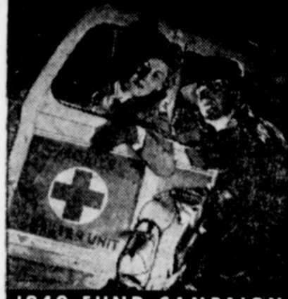
1949 FUND CAMPAIGN

$39.95 electric puts this great range in your kitchen!