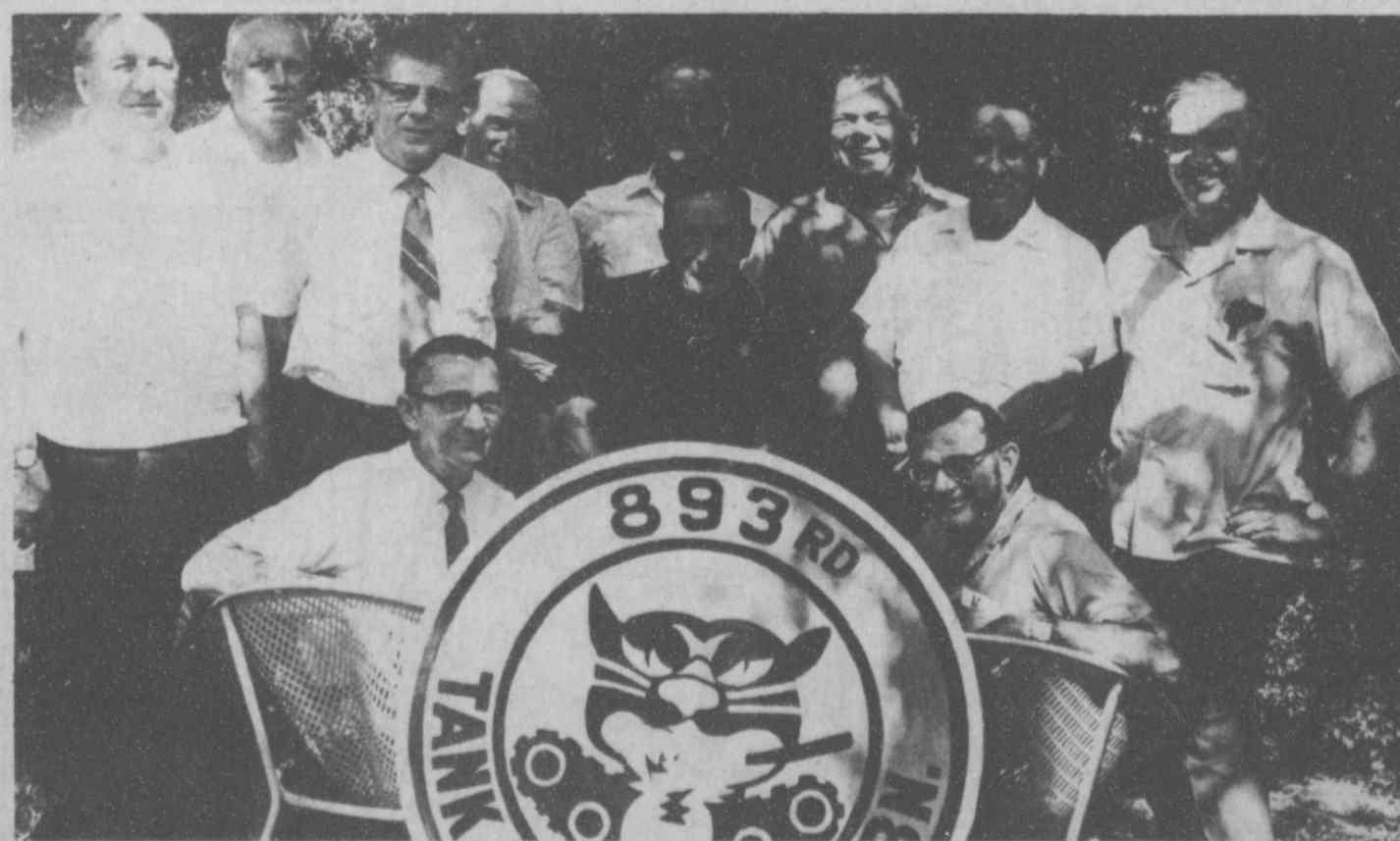
EIGHT HUNDRED NINETY THIRD TANKERS REUNITE... Members of the 893rd U.S. Army Tank Destroyer Battalion reunited Saturday at a Dutch treat luncheon at the Chateau Kille Restaurant. The 893rd was the first military unit to move to camp Hood during World War II.

Following the luncheon the men and their wives enjoyed an afternoon of reminiscing about the good ole days at Hood.