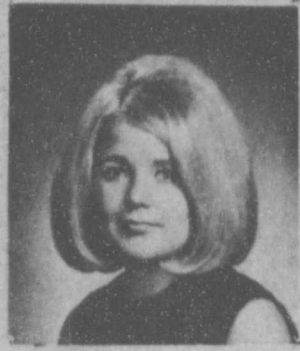
by sally jund