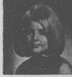
by sally jund

ANNUAL PLEA TO CLUBS ... When September rolls around, Gatesville's youngsters are involved in GHS activities, football, church and social clubs. So are the members of the "older generation" involved in civic, church and social ac-