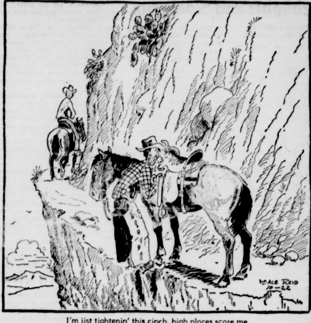
I'm jist tightenin' this cinch, high places scare me.