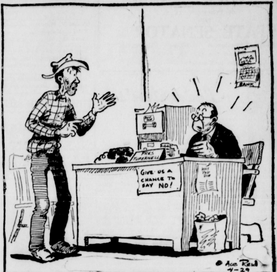
I bet you won't believe them cows I had mortgaged got struck by lightning and all them unmortgaged ones had twin calves.