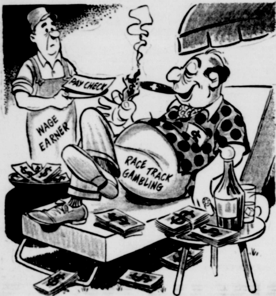
"PUT SOMETHING IN THE POT, BOY!"