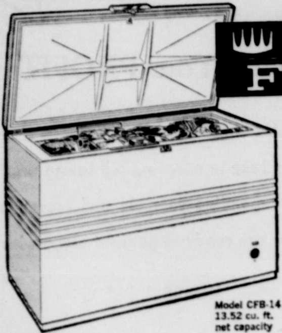
Model CFB-14 13.52 cu. ft. net capacity