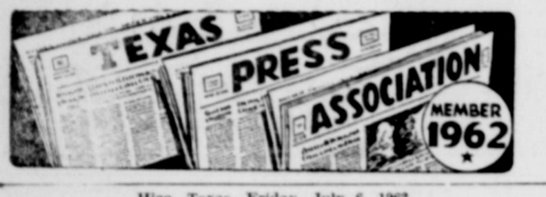
Hico, Texas, Friday, July 6, 1962.