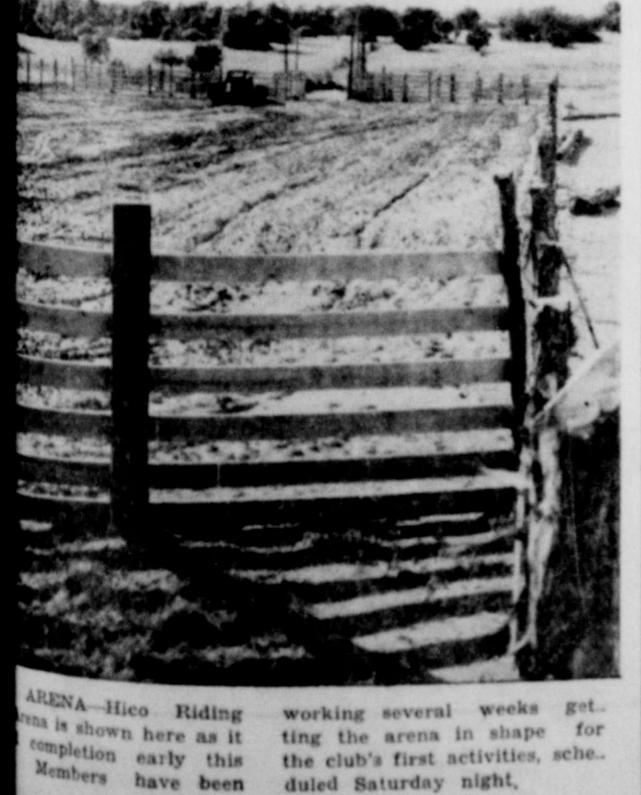
ARENA—Hico Riding Club arena is shown here as it appears in shape for completion early this week. Members have been working several weeks getting the arena in shape for the club's first activities, scheduled Saturday night.