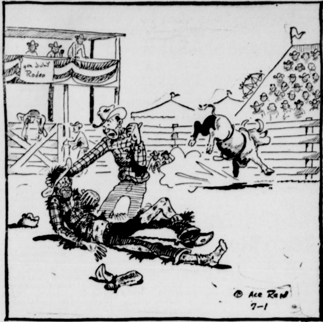
"Jake, you ain't much bull rider, but you shore know how to excite the crowd."