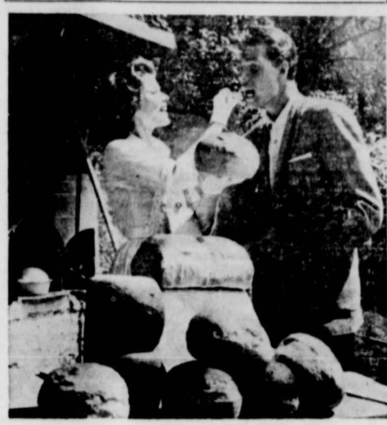
Photo Courtesy Canadian National Railways Freshly-baked bread from an outdoor bake oven on the Gaspé Peninsula of La Province de Quebec, tastes mighty good. Outdoor bake ovens are common sights in the habitant villages of the Gaspé region. Regular tours are operated by the Canadian National from Montreal to Mount Joli and around the Gaspé Peninsula by motor car. FNS