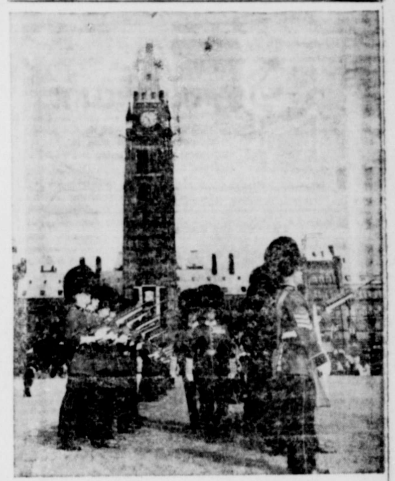
One of the most spectacular sights in Canada's Capital City of Ottawa during August is the colorful ceremony of the "Changing of the Guard" on the grounds of the Parliament Buildings. The Peace Tower of the majestic group of buildings, which are adjacent to the Chateau Laurier, is in the background.