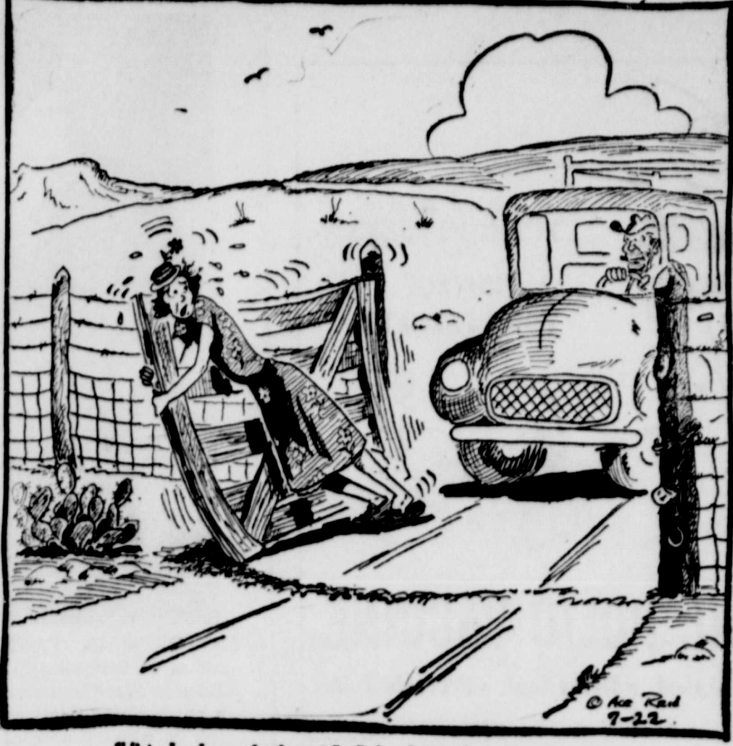
"Just why do you bother with all the chains when this gate can't even be pushed open?"