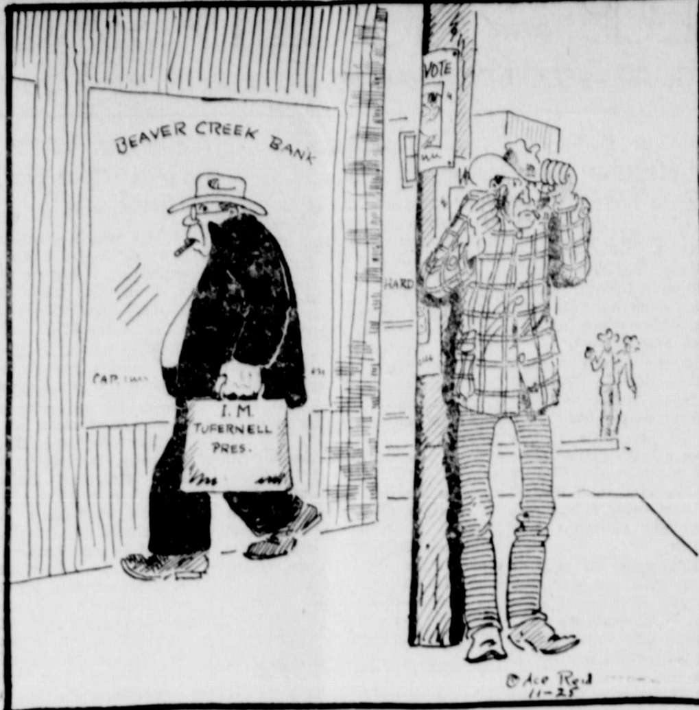
Look, one's tryin' to hide 'cause he's scared the Banker wants his money back and the other one's scared 'cause he's afraid Jake's gonna want to borrow more.