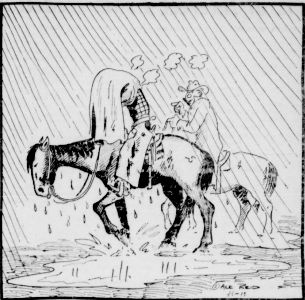
"Hey, it's takin' a mighty long time for you to git OUR last cigarette lit!"

available to farmers who comply with their farm acreage allotments. On the other hand, if more than a third of the voting growers oppose the quotas, then there will be no quotas and no penalties applicable to the 1963 upland cotton crop, and price support to farmers who comply with their farm acreage allotments will be available at 50 percent of parity, as directed by law.