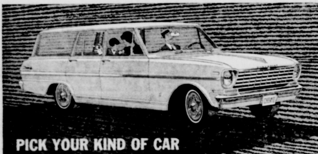
PICK YOUR KIND OF CAR

AT YOUR CHEVROLET DEALER'S ONE-STOP SHOPPING CENTER