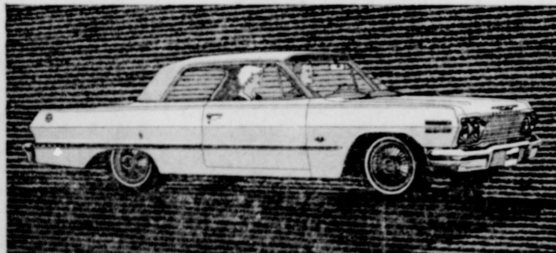
'63 Chevrolet Impala Sport Coupe