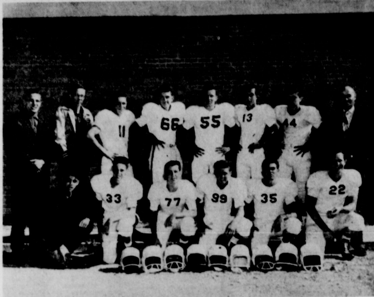
COMPILES GOOD RECORD— Members of the Fairy High School six-man football team recently completed one of the most successful seasons in history. Out of a 10-game slate the Tigers lost only to Abbott.