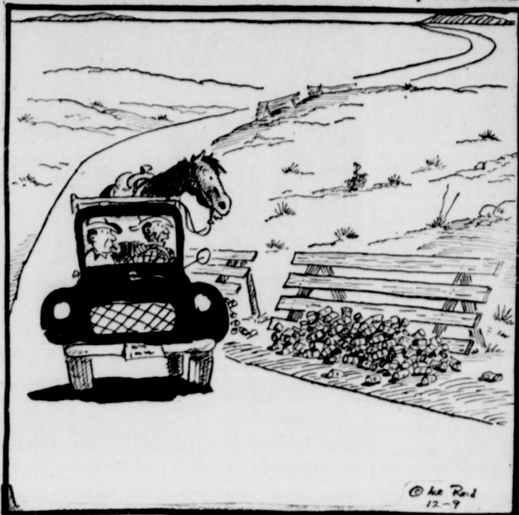
"Oh, them fences ain't built so much fer snow, they're more to keep the bear cars from driftin' across the pasture."