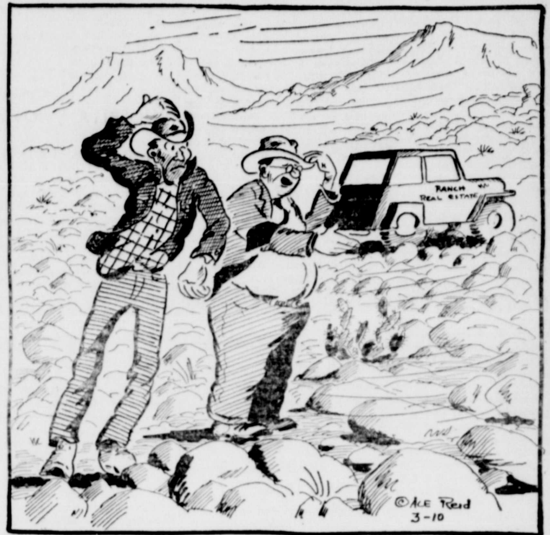
"No, the wind don't blow here all the time ... it rained here once!"

We are now buying hogs every Monday, as well as regular sale day. Highest market price paid both days.