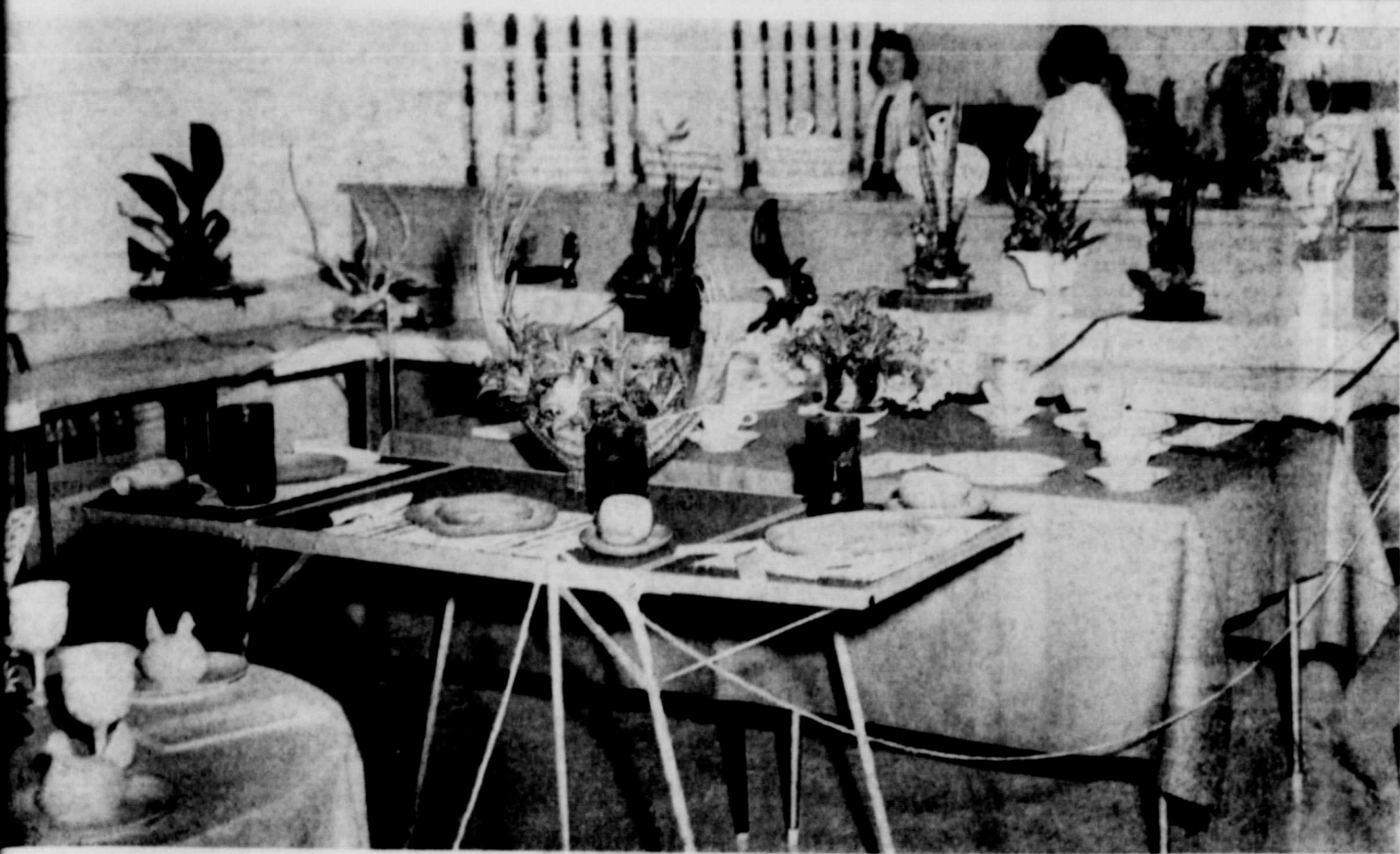
WINNERS SHOW SCENE—Tarrangements, as exhibited at Hico Garden Club Flower Show last Saturday are shown

here. A large number of visitors attended the show, which was declared a success from every standpoint.