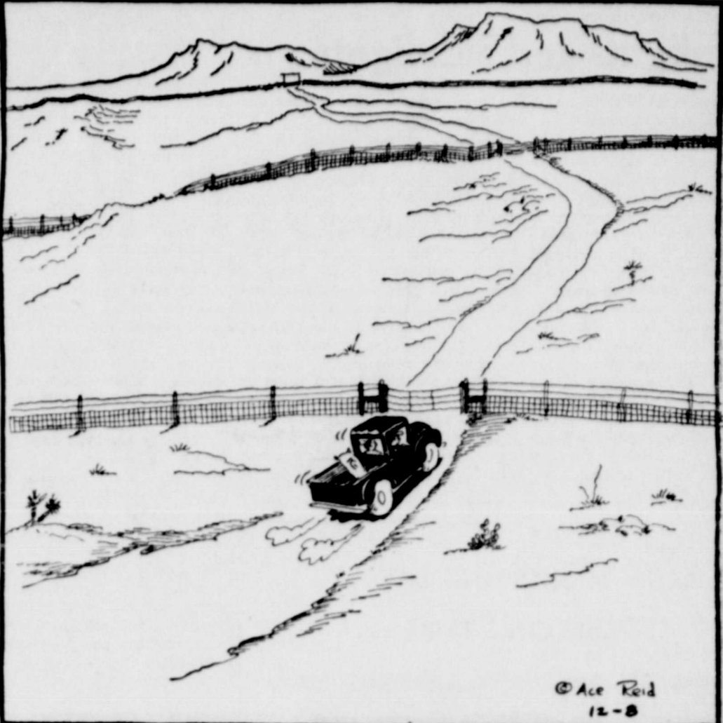
"Maw says she ain't leavin' this ranch again until I put in cattle guards... she ain't left in 2 years!"