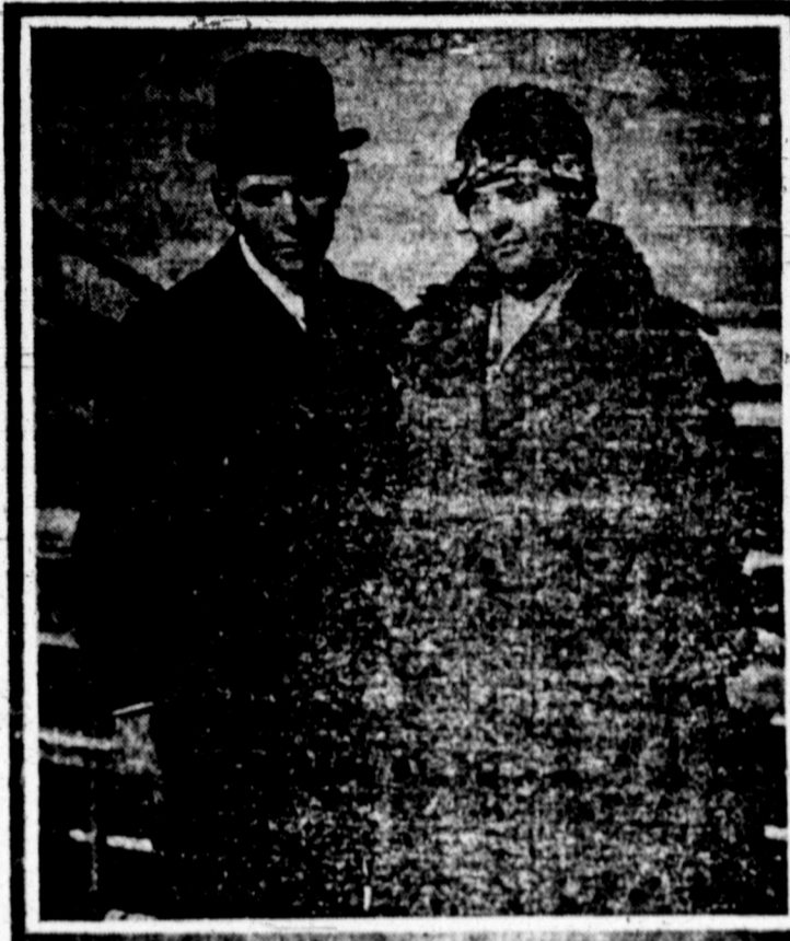
Mr and Mrs Jimmy Wilde.

JIMMY WILDE, GREAT BRITAIN'S RING MARVEL, HERE IN QUEST OF NEW HONORS.