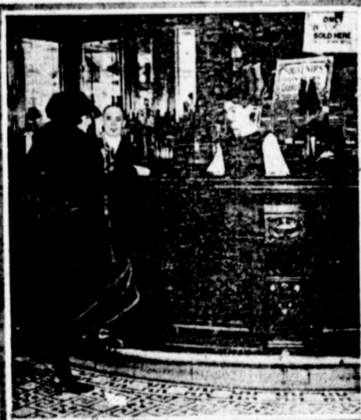
Buying shoes over the bar.

NEAR BEER AND SHOES CO-MINGLE AT THIS NEW YORK BAR.