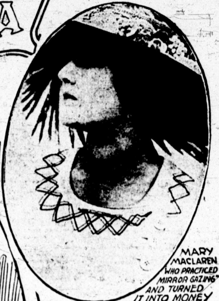
MARY MACLAREN WHO PRACTICED MIRROR GAZING AND TURNED IT INTO MONEY

Photoplay success never comes from reading fake books on how to succeed in Motion Pictures or from patronizing fake schools of acting. Never miss an opportunity to appear in amateur theatricals--- AND practice "mirror gazing," study and analyze your own expression.