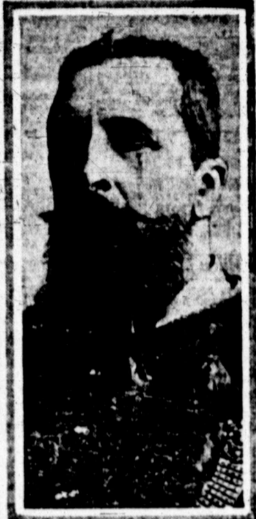
Count Albert Apponyi.

Count Albert Apponyi, Magyar Nationalist leader, has accepted the presidency of the Hungarian Peace Commission, which will go to Paris to negotiate the Hungarian Peace Treaty, according to a report from Paris. It is expected that the Hungarian Peace Commission will be summoned to Paris within a few days. Count Apponyi is well known in this time. He has had a long political career in Hungary, having served as Minister and also Prime Minister during the monarchy regime. He has visited here several times.