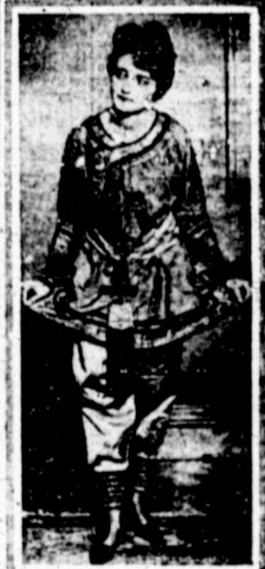
Pantaloon are the latest.

The modistes of Paris have decreed that members of the fair sex must adopt the "pantaloon and Oriental blouse" which is positively the latest in fashions. Here with we have a picture of a pretty American girl wearing 'em. Yes, and right in New York. For one of America's biggest importers of Parisian frocks, recently brought back several of the pantaloon combinations and is displaying the costume in New York.