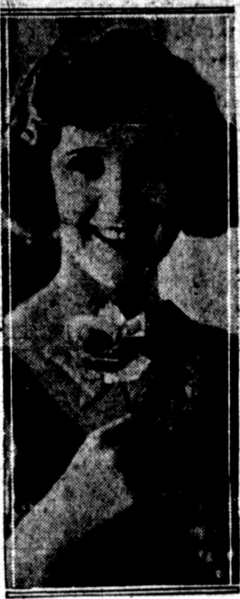
Constance Talmadge in "A Woman's Place."