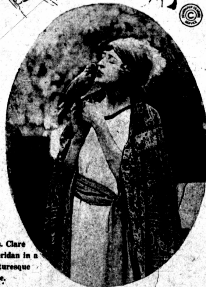
Mrs. Clare Sheridan in a Picturesque Pose.

She became an international figure when she molded the features of Lenin and Trotsky, and then described her experiences in a book, "From Mayfair to Moscow." After speaking disparagingly the way she was entertained by several personages in Manhattan's haut-monde, Mrs. Sheridan has returned from Mexico to New York to face the aristocrats she criticised.