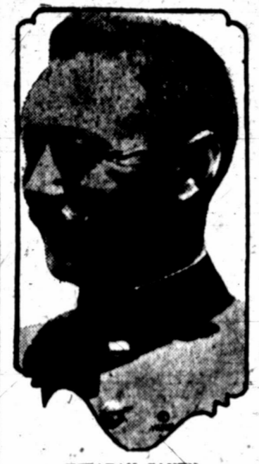
ESTABAN CANTU former governor of Lower California, is reported to be leading the rebel troops against the Oregon government.