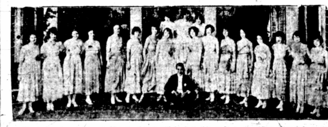
The improved and enlarged Majestic theater will host this week, to the "Rose Time," a musical comedy company offering high class stage productions at popular prices.