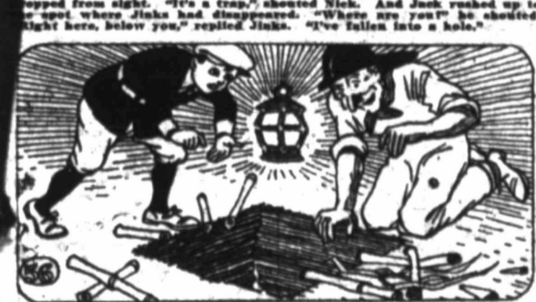
When it was that Jack and Nick and Bibbs discovered that the opening into which Jack had tumbled was a large square hole which had been covered by bamboo strips and leaves. Jack was about to help Jack out when the cry of "gold" echoed forth. Jack had found gold.