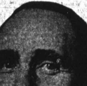
MEET REPRESENTATIVE ROBERT H. LEE ALLEN, OF WEST VIRGINIA, WHO SUCCEEDED TO THE SEAT OF GEORGE M. DOWERS AT THE UNITED STATES CAPITOL.

Meet Representative Robert H. Lee Allen, of West Virginia, who succeeded to the seat of George M. Dowers at the United States capitol.