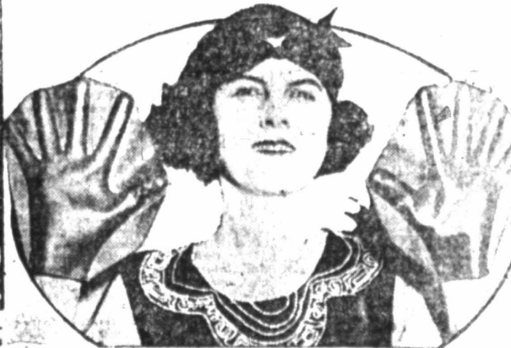
ANOTHER ROMANCE of the screen was disclosed recently when it was learned that Alma Rubens, film star, had been married several weeks to Dr. Daniel Carson Goodman, author and film producer. The wedding took place Labor Day and American Red Cross in the recent principle of a duck's webbed feet and are a great aid in swimming. As news of it came as a surprise to the picture world, they displace a great deal of water, they make for speed.