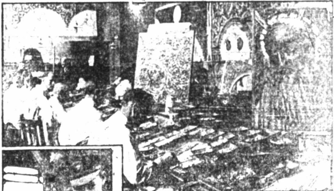
GERMAN ARTISTS are shown here at work making mosaics for the new St. Louis cathedral. The mosaic industry has been at a low ebb for several years in Germany and the order from St. Louis was something in the nature of a "life-saver."