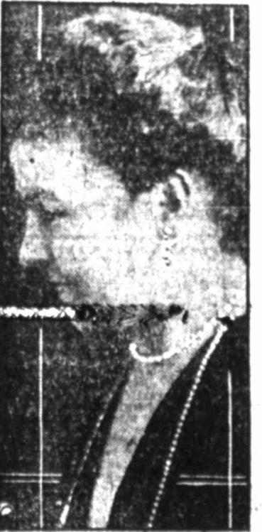
HIT BY STONE. This is Hermione, wife of the ex-kaiser and ruler of Denmark. While walking in the garden of the Kaiser's grounds recently, she was severely hurt by a stone thrown at her. Police are trying to find out who made the deliberate attack.