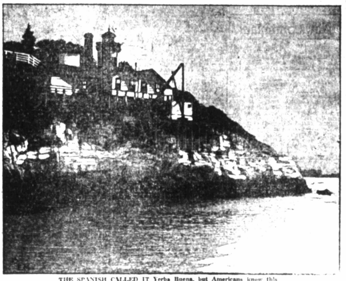
THE SPANISH CALLED IT Yerba Buena, but Americans know this famous landmark in San Francisco Bay as Goat Island. It is on the route of all trans-bay ferry lines, and the island itself is the location of one of Uncle Sam's most important west coast naval training stations.