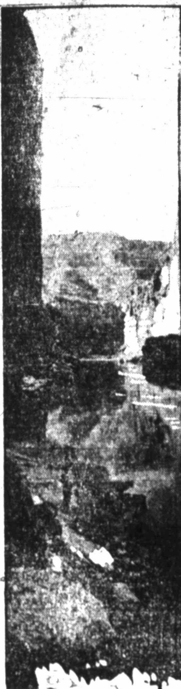
SCENIC SPLENDOR, unsurpassed anywhere in the world, is in this view of Marble Canyon where the Colorado River flows. This picture is a downstream glimpse of the magnificent panorama.