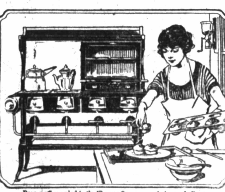
Brown majolica cooked in the Florence Oven are evenly browned all over

225-231 Waggoner Bldg. Entrance Room 228