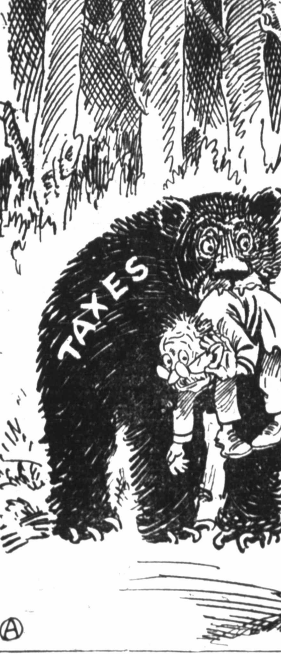
Illustration by MORRIS