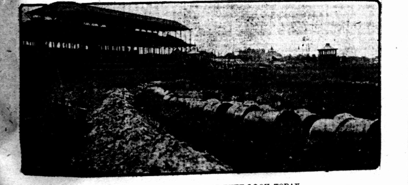
THE WASHINGTON PARK TRACK AND GRAND STAND AS THEY LOOK TODAY.

Intersect the grounds, the tracks on which the world's most famous horses raced to the accompanying shouts of thousands is being dug up and sewers laid across it. Washington Park, once the pride of racing men of the west, is gone forever.