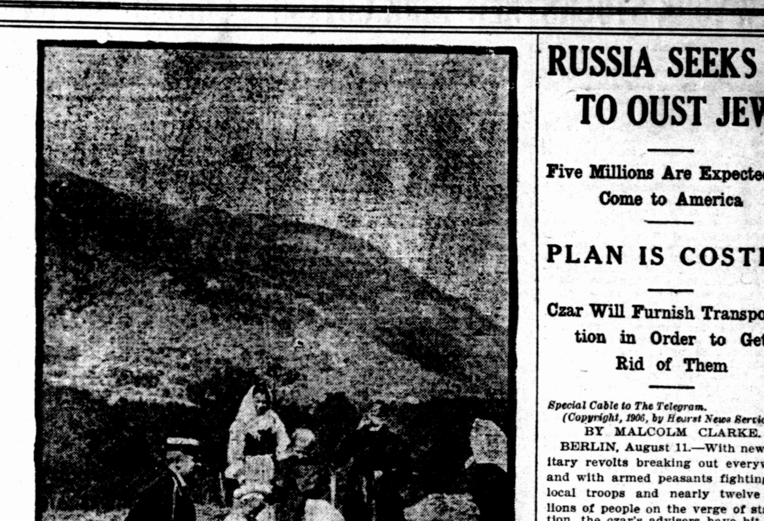
RUSSIA SEEKS TO OUST JEWS Five Millions Are Expected to Come to America

COPENHAGEN, Aug. 11.—King George of Greece, who, as usual, is taking the waters at Aix-les-Bains, will shortly start for this city, where he will meet his three sisters, Dowager Empress Maria Feodorovna, Blisodina, Queen Alexandra of England and the Duchess of Cumberland, who will spend next month at Fredensborg castle with their brother, King Frederick.