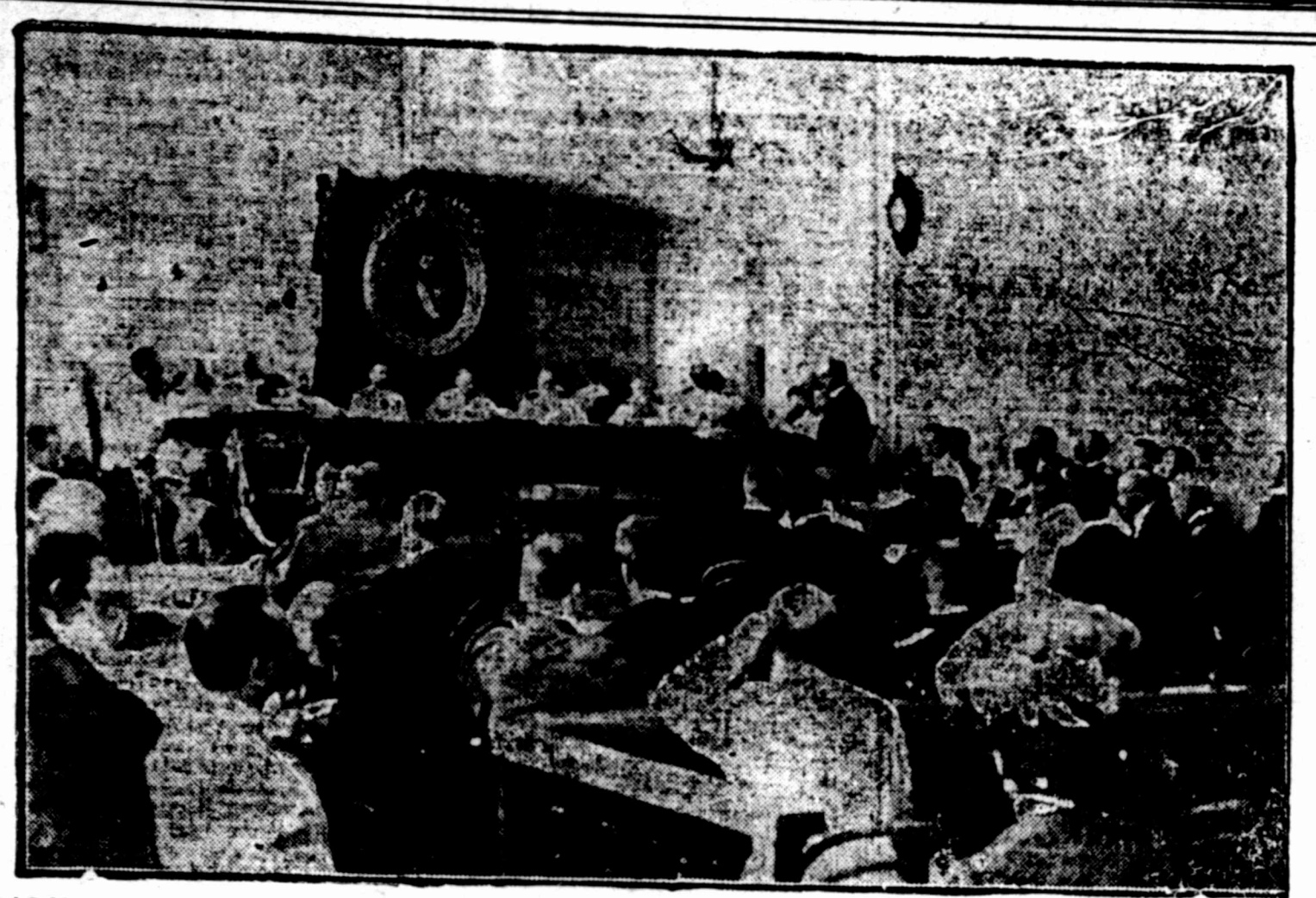
ST. PETERSBURG, Aug. 11.—Photo shows the wonderfully impressive scene when Admiral Rozhdestvensky, the hapless commander of the Baltic squadron, annihilated by the Japanese in the battle of Teshushima, was tried by the naval court of war at Cronstadt. The admiral, who is seen standing in citizen's clothing, on the right of the picture, made a profound impression on the court by his manly plea of guilty.

VIENNA, August 11.—Viennese beggars prosper so well in their trade that the most successful among them are able to go to fashionable watering places for the "cure."