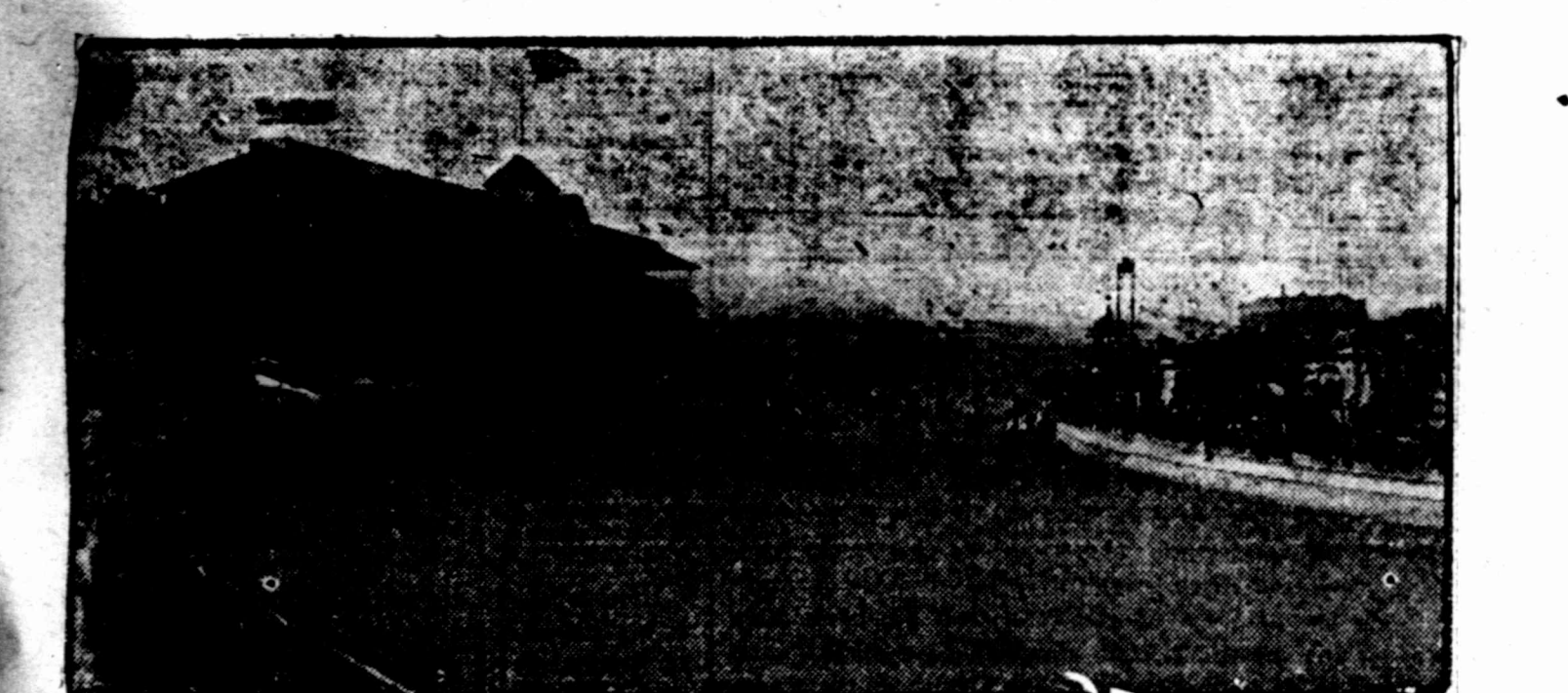
THE START OF THE LAST AMERICAN DERBY, 1904, WHICH WAS WON BY HIGHBALL.

CHICAGO, Ill., Aug. 16.—Ruthless hands of unscrupulous workmen are destroying the last landmarks of the famous Washington Park race course. The mammoth grand stand is a jumble of steel girders, the stables that held the pets of the racing world are masses of kindling wood, the club house will soon be destroyed, the track is weed-grown.