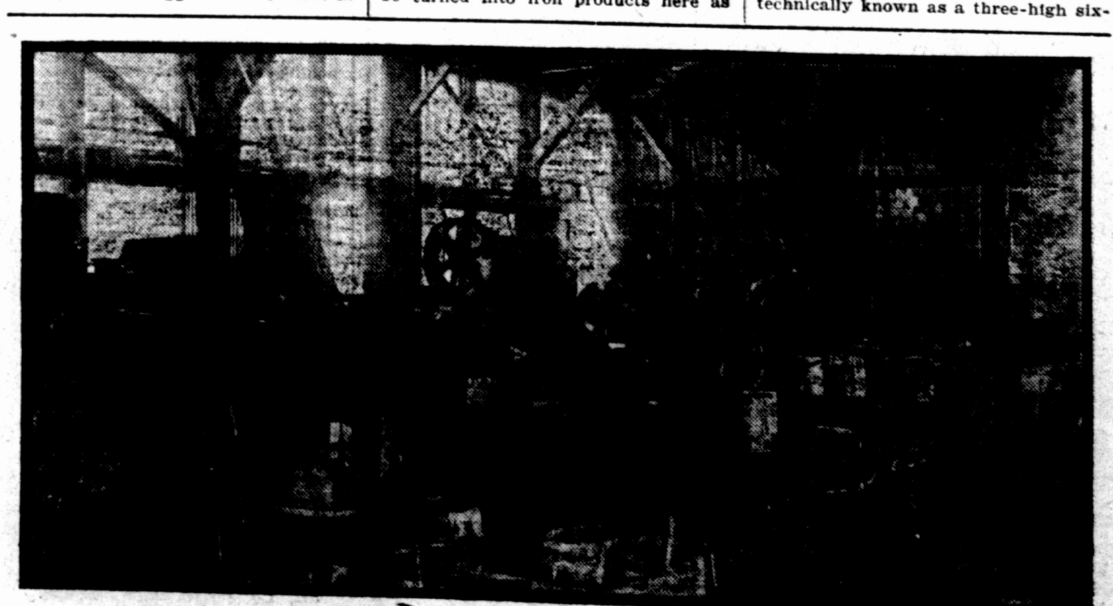
AN INTERIOR VIEW OF FORT WORTH IRON AND STEEL PLANT.