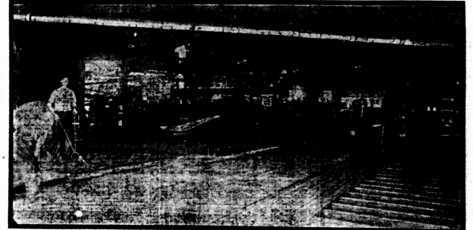
INTERIOR VIEW OF FORT WORTH IRON AND STEEL COMPANY'S PLANT, SHOWING MEN AT WORK.

Today there is over $200,000 invested in the Fort Worth Iron and Steel Company's plant. Since its inauguration the capacity has been doubled twice and machinery is now going in to double it again. At the present time the plant is only running during the day, but when the new equipment is ready three eight-hour shifts will be put on and worked twenty-four hours a day. In two or three years the total amount of capital invested will probably reach the half-million mark. This statement is based upon the growth in the past and the present demands of the trade. The legitimate field of the Fort Worth Iron and Steel Works extends from South McAlester on the north to the Gulf of Mexico on the south, and from El Paso on the west to Little Rock and Shreveport on the east. Out of seven railroads leading into Fort Worth, six of them are now purchasing all the iron and steel supplies the Fort Worth Iron and Steel Company can furnish. Contractors for the big new buildings now in course of construction in Fort Worth are using the home product. The new building next to the Carnegie library has alone ordered twenty-eight tons. The telephone and telegraph companies of the south make big purchases of cross arm braces here. The big wholesale houses in the Fort Worth territory are patrons of the Fort Worth Iron and Steel Works because they are no longer compelled to carry such large stocks. Hurry up orders can be filled promptly from the factory. T.