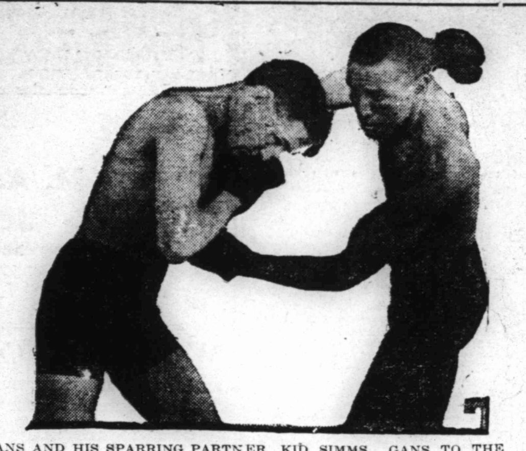
GANS AND HIS SPARRING PARTNER, KID SIMMS. GANS TO THE STOMACH.