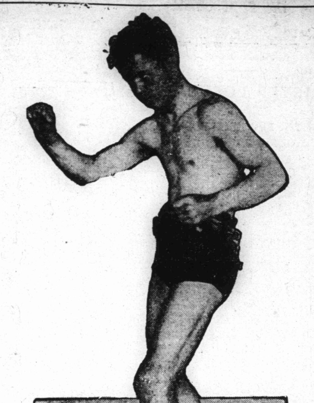
BATTLING NELSON IN A SPARRING POSE.