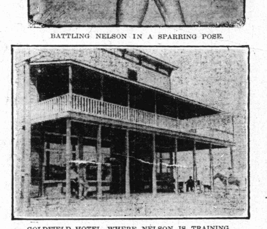
GOLDFIELD HOTEL WHERE NELSON IS TRAINING.