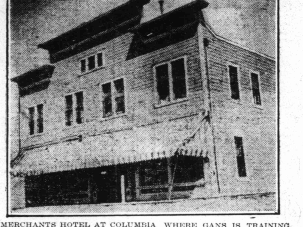
MERCHANTS HOTEL AT COLUMBIA, WHERE GANS IS TRAINING.

24 INNING GAME WON BY PHILLIES 18,000 Cheer Remarkable Feast of Picher Coombs