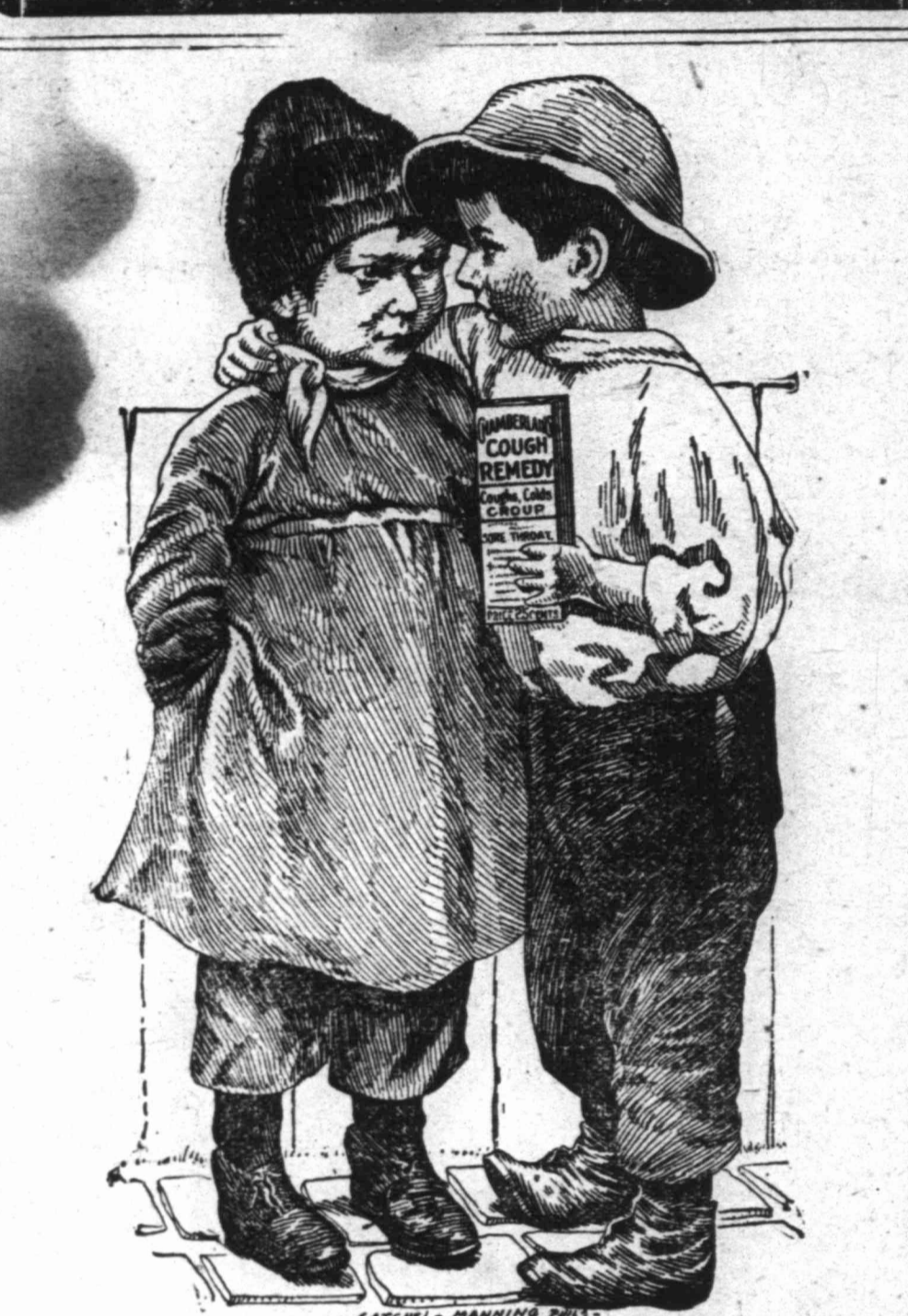
FRIEND TO FRIEND.

Varicocele I treat this disease by painless methods, and with no detention from business. The stagnant blood is driven from dilated veins with the assistance of our improved Varicocele Trans and Library-Chemic process, the parts being restored to their natural condition and circulation reestablished.