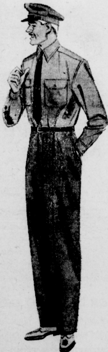
BLUE AND STRIPE OVERALLS

MEN AND BOYS LEVIS 2.35 - 2.98 - 3.55 - 3.75