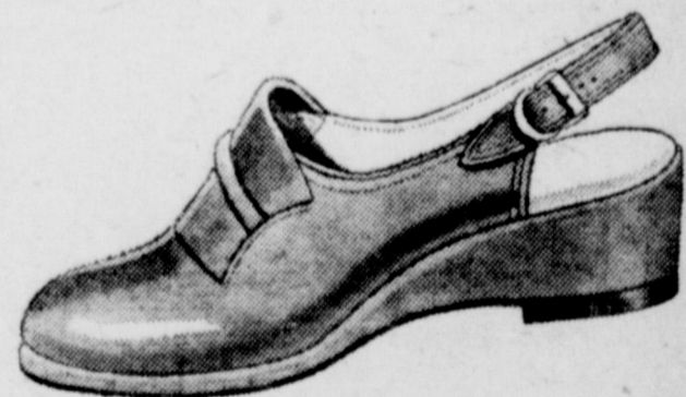
LADIES SMART MAID SHOES

Crepe Sole in black, tan and white Priced at only