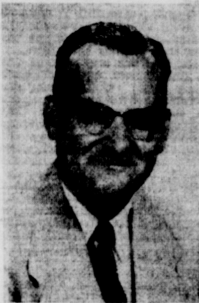
Buffaloes Edge Eagles 52-49 Here Tuesday

The Cross Plains Buffaloes evened up their District 9-A record at 2-2 here Tuesday night with a 52-49 victory over the Goldthwaite Eagles.