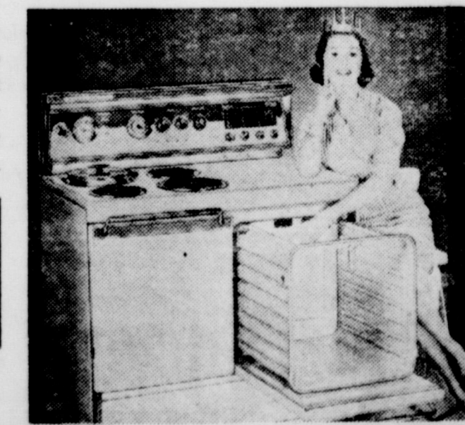
The ovens on electric ranges are easy to clean. The units are easily removed and the porcelain cleans so very, very easily