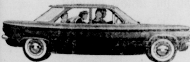
Corvair 700 4-Door Sedan

If you haven't driven it yet, you don't know what a delight driving can be. Its steering, response, traction and roadability are unique because it's a unique car —the only U.S. car with an air-cooled airplane-type rear engine, transaxle and independent suspension at all four wheels. Be in on the know. Find out what delightful differences this advanced design makes.