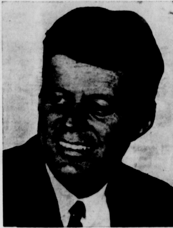
John Fitzgerald Kennedy will be inaugurated thirty-fifth President of the United States Friday. Largest crowd ever to view inaugural ceremonies is expected to be in the na-