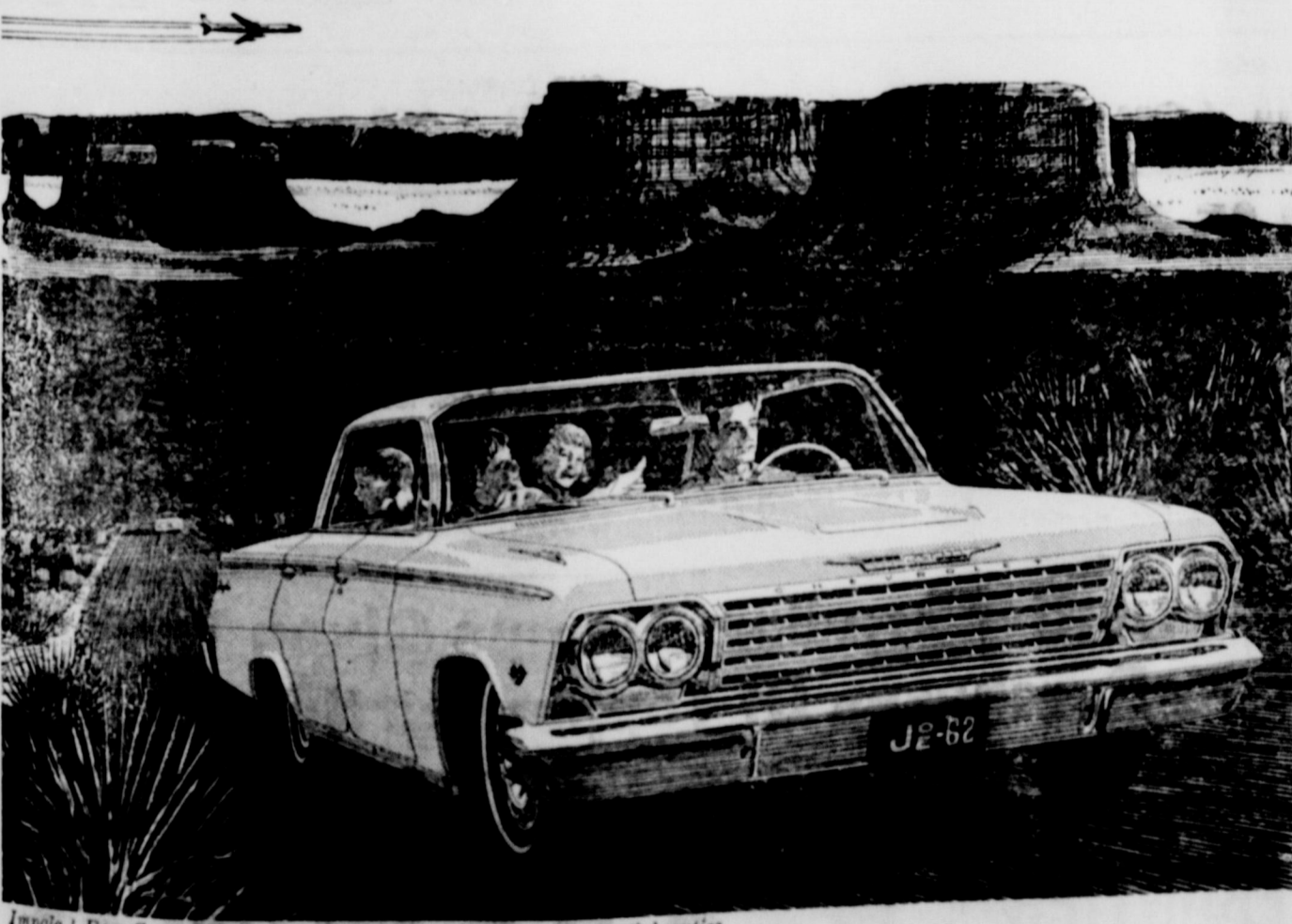
Impala 4-Door Sport Sedan—just one of 14 restful, zestful Jet-smooth beauties.

Get set for Fun and Sun at your Chevrolet dealer's. If you aren't in a holiday mood already, his buys will quickly put you in one. Then the real fun begins when you aim a Jet-smooth beauty at vacation land. Bring on those choppy roads or rolling highways—makes no difference because you've got a big cushiony Full Coil spring at each wheel to take the wrinkles out of the worst roads around. And a team of over 700 insulators and absorbers to wall off sound and vibration. Add VS sizzle or 6 savings, rich, roomy interiors, comfort-high seats for easy rubbernecking, a deep-well trunk, easy bumper-level loading, and Body by Fisher craftsmanship—and you've got about all the car you could possibly want. Jet-smooth Chevrolet