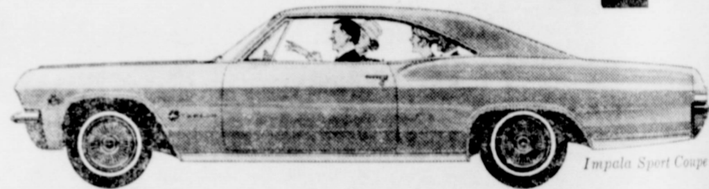
'65 Chevrolet Impala Sport Coupe

Your wait for one of these new 1965 Chevrolets is about over—and we want to thank you for your patience. Come see us now. When you get behind the wheel, you'll be glad you waited!