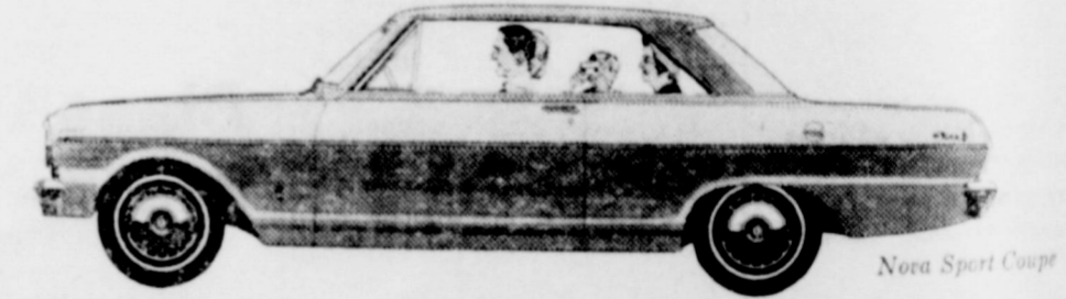
'65 Chevy II Nova Sport Coupe

Fresh-minted styling. V8's available with up to 350 hp. A softer, quieter ride. And it's as easy-handling as ever.