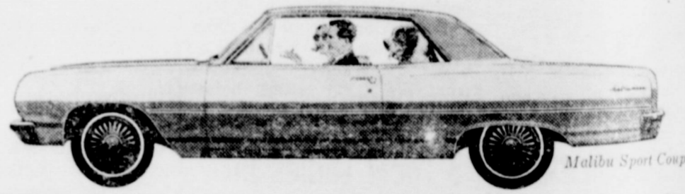
'65 Chevelle Malibu Sport Coupe

It's longer, wider, lower. It's swankier, more spacious. You could mistake it for an expensive car—if it weren't for the price.