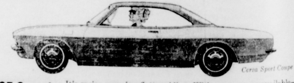
'65 Corvair Corvair Sport Coupe

Clean new lines. Fresh new interiors. A quieter 6 and—V8's available with up to 300 hp. Thrift was never so lively.