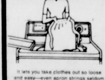
and easy—even apron strings seldom snarl. Reduces tangling and wrinkli