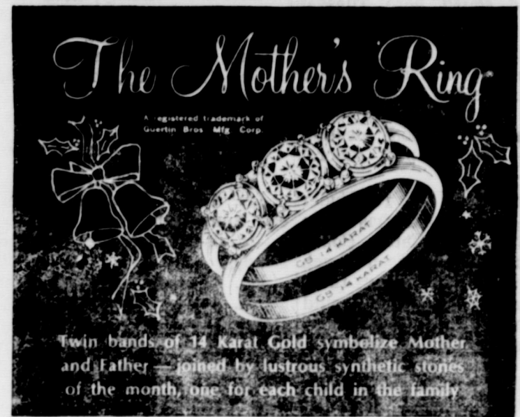
Twin bands of 14 Karat Gold symbolize Mother and Father — joined by lustrous synthetic stones of the month, one for each child in the family.

Of all the gifts you could choose for Mother this is the one she'll treasure longest