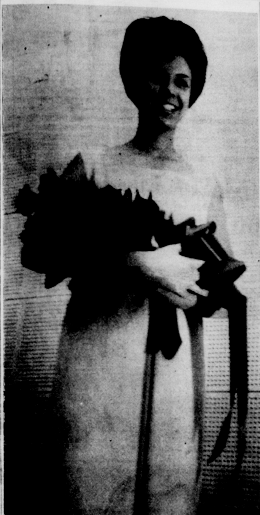
Red Roses For Most Beautiful Girl