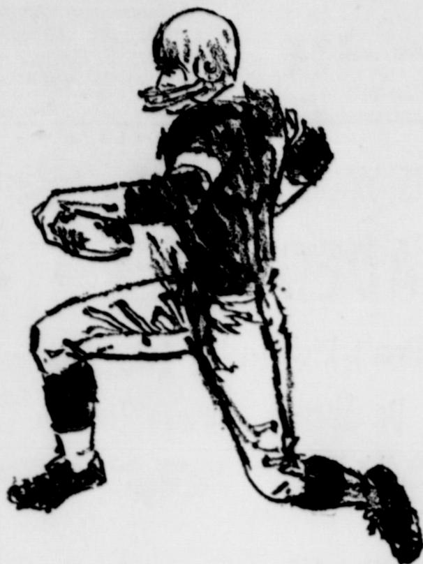
BOY'S 13 CLEAT