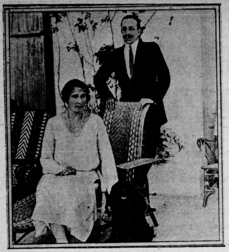
THE SPANISH ROYAL FAMILY AT HOME.

Madrid-The King and Queen of Spain-an intimate pose of the Spanish Royal couple at their new palace in Barcelona.