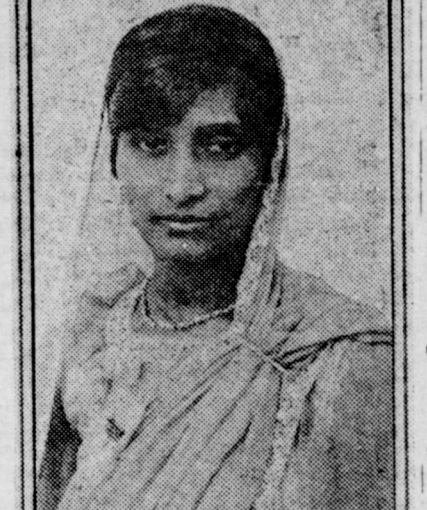
An Indian Princess Who Wears Dia monds In Her Nose.