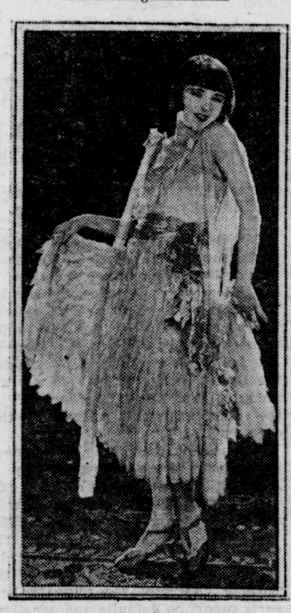
Dame Fashion Speaks.

Many a family budget has fallen evidence which they have not yet made down because it provided for only one of them getting a haircut.-Knoxville