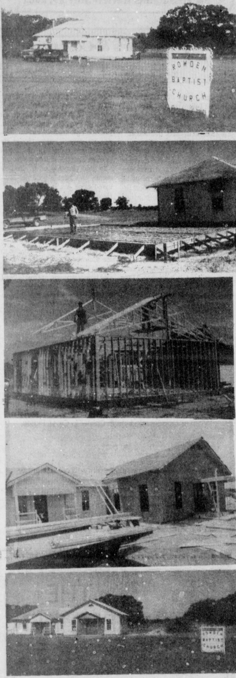
NEW CHURCH SANCTUARY—This series of photos shows the new Sanctuary at Rowden Baptist Church located on Highway 36, 12 miles West of Cross Plains. The top photo was taken before construction began and the final picture shows the new Sanctuary near completion. The new Sanctuary will be dedicated sometime in late summer.