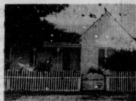
ROBERT E. HOWARD MUSEUM