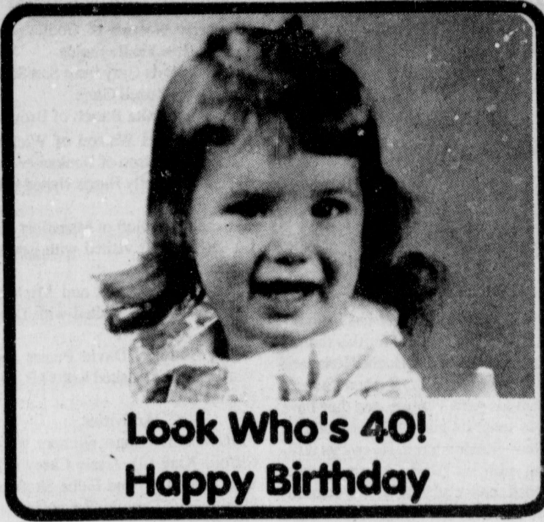
Look Who's 40! Happy Birthday

Some historical information is reprinted from the Callahan County history book, I Remember Callahan .