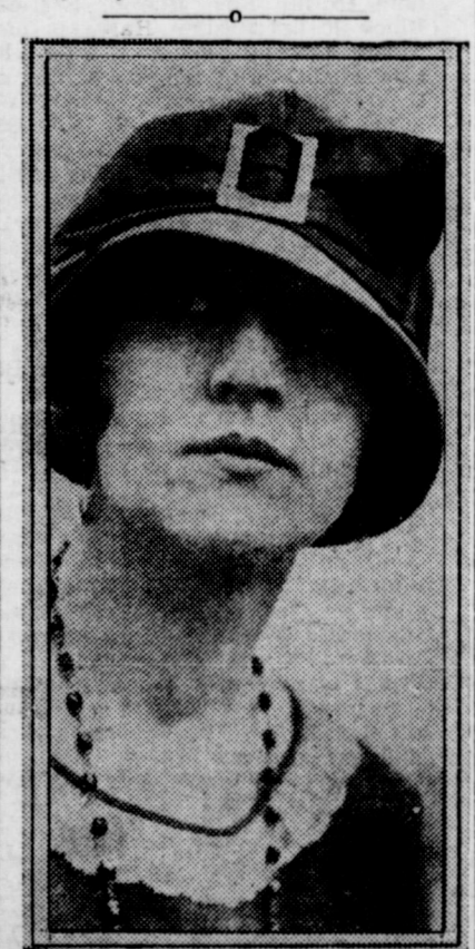
Girl Swimmer to Attempt Golden Gate Crossing.

We have our flour contest May 30th. Serve cake and ice cream all evening. her parents and other relatives. They Everybody come.