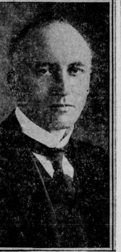
SIR JOHN SIMON.