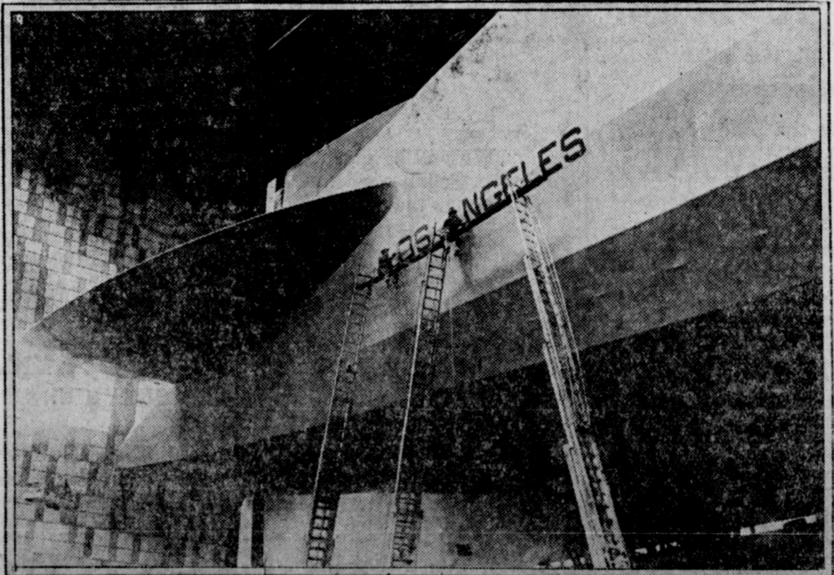
THE ZR-3 IS NOW THE LOS ANGELES.

These transmissions proved successful, photographs were transmitted by radio to England and return.