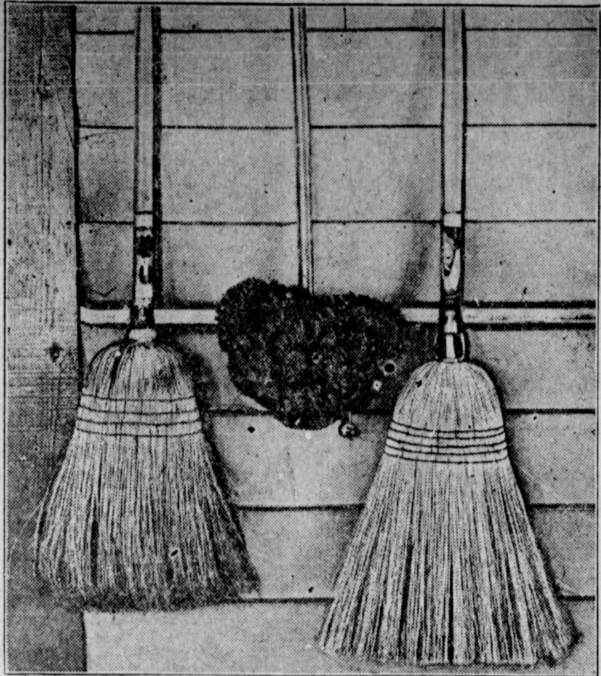
Proper Manner for Hanging Brooms.

(Prepared by the United States Department of Agriculture.)