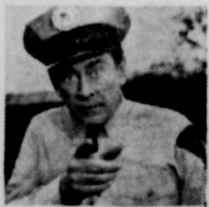
(Louis Nye—The Cleanup Man)

Published as a public service in cooperation with The Advertising Council.