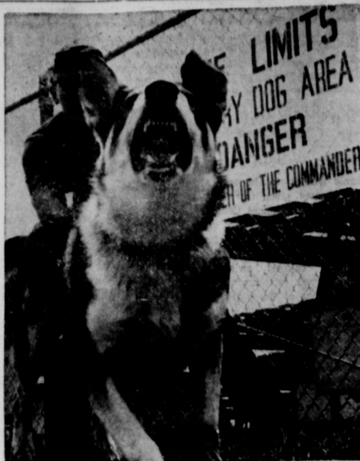
LOOK MA, NO CAVITIES!—but one of these dogs can open up a big hole in any crowd. A team of trained sentry dogs will demonstrate their military usage and capability as part of the giant Military Tattoo Friday evening, October 14, in the Cotton Bowl at the State Fair of Texas. Overall dates of the 1966 "Exposition of Young America" in Dallas will be October 8 through 23.