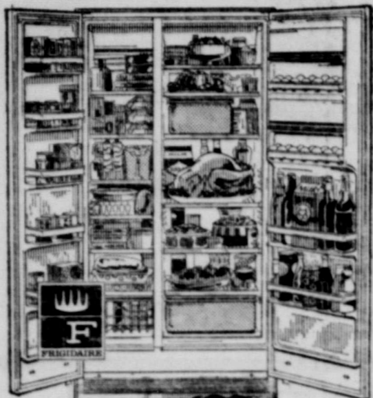
Model FPD-19VK, 19.1 cu. ft. (NEMA standard) 4 colors or white.