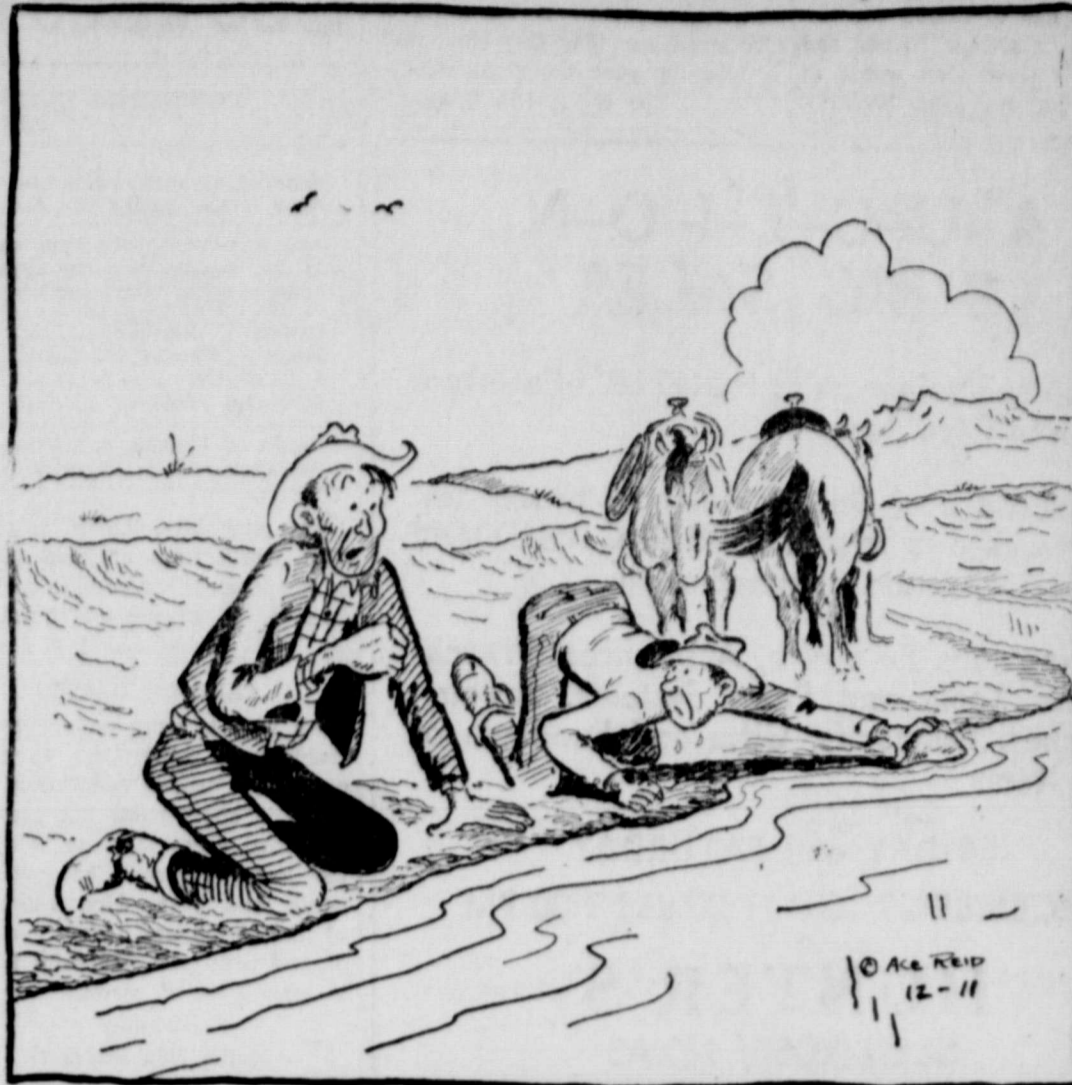
"Gosh, I thought I swallowed my tobacco, but here it is, so now I wonder if it wuz a tadpole er a bullfrog!"