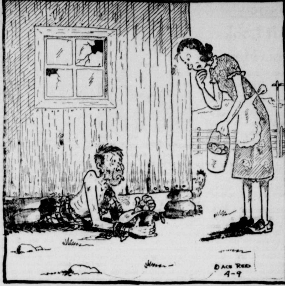
"Paw, I shore hope that ole hen didn't have as much trouble layin' them eggs as you did gatherin' 'em!"

A NEW SERVICE FOR HICO AREA FARMERS & RANCHERS! We Are Now Purchasing WOOL & MOHAIR AT MARKET PRICES!