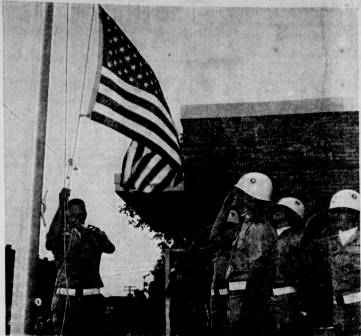
RAISING THE COLORS—A Tarleton State College color guard was in charge of flag-raising ceremonies at the post office

dedication last Friday. The flag, which has flown over the White House and the U.S. Post Office Building in Washington,