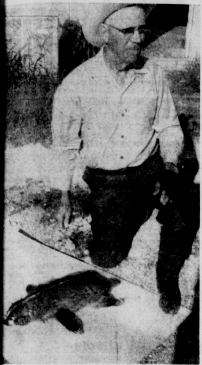
"BADGERED" - C. who lives near Olin badger one day reter digging him from