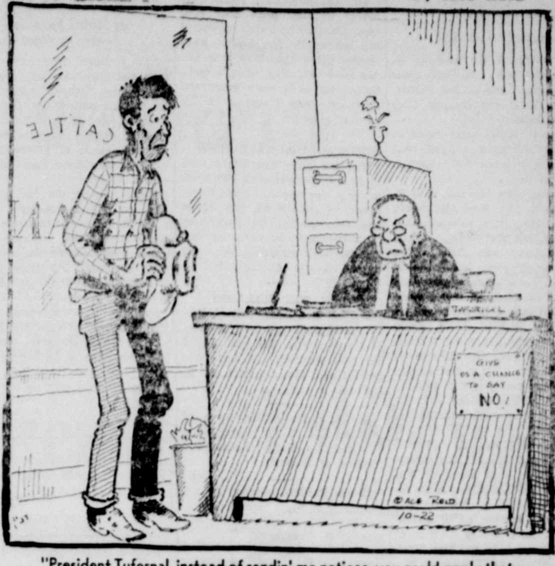
"President Tufernal, instead of sendin' me notices, you could apply that postage to my note ... we'd git it paid off a lot sooner!"