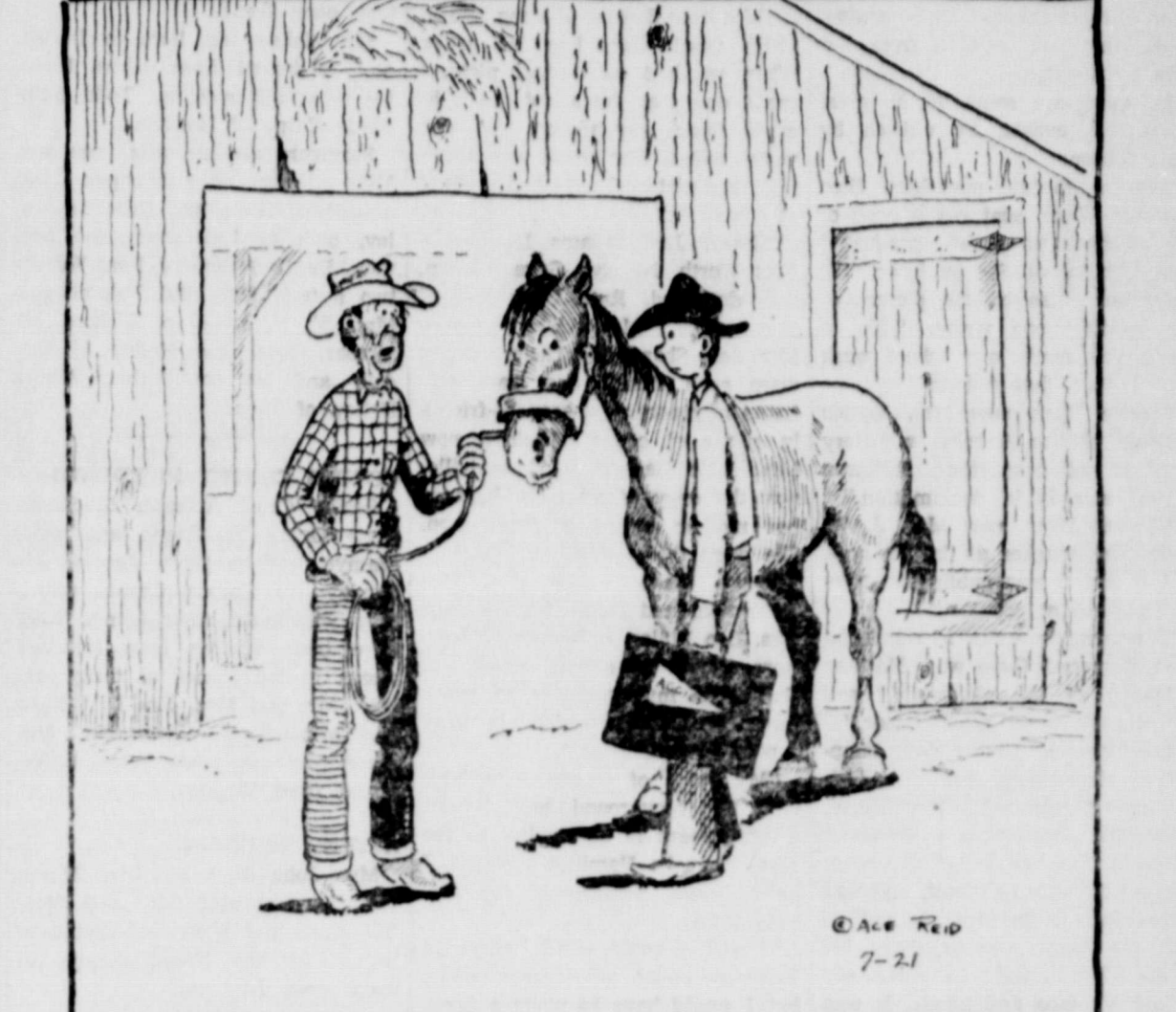
"So somebody told you this wuz a good outfit to work fer . . . good boss, good pay. Did they also tell you we got the gooddest bunch of pitchin' hosses and the gooddest fightin' cows in the state!"