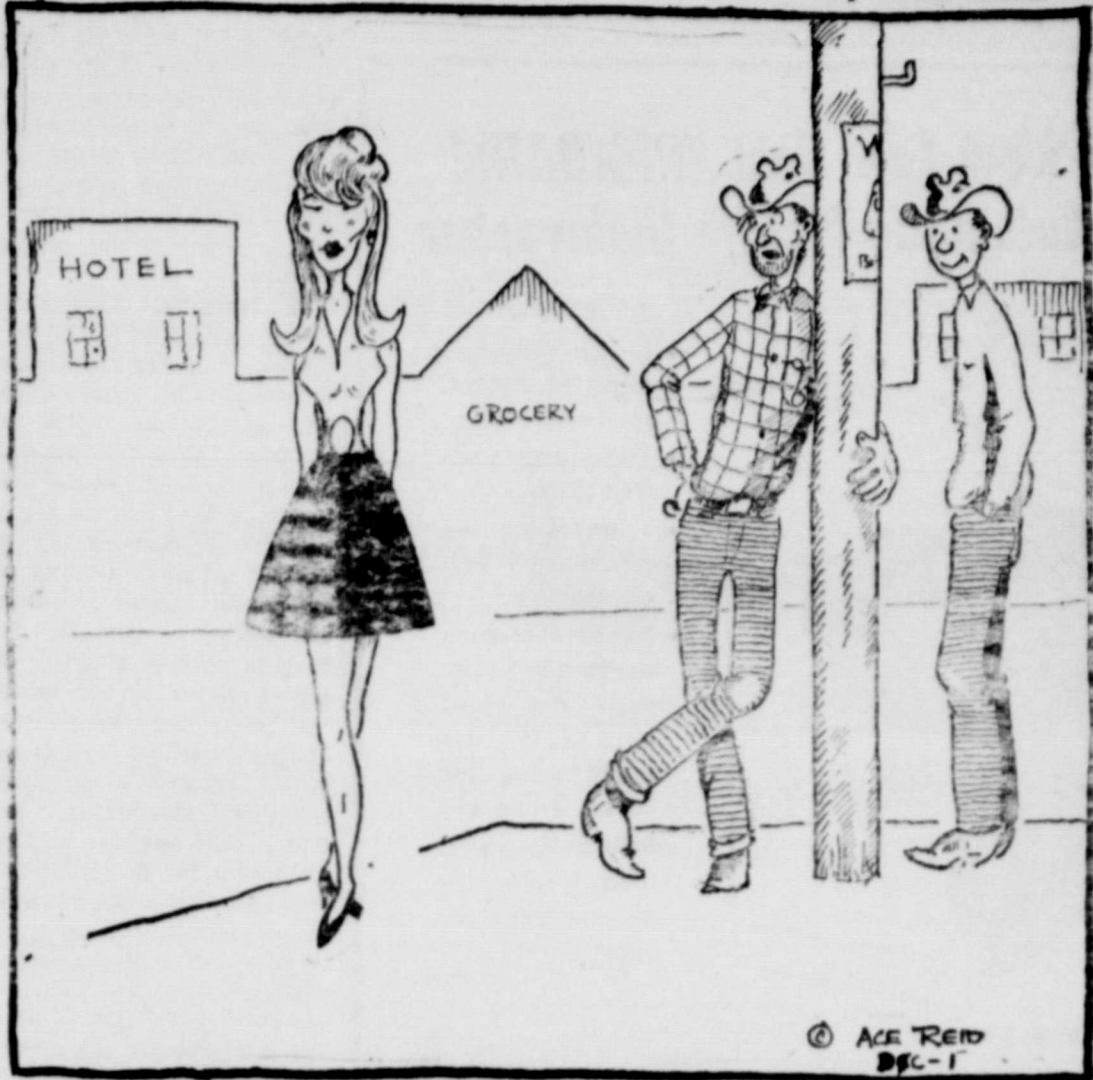
"Wul, as skinny as she is, she couldn't possibly grade prime."