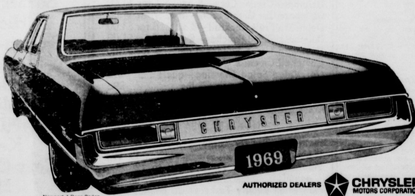
Newport 4-Door Sedan

AUTHORIZED DEALERS CHRYSLER MOTORS CORPORATION