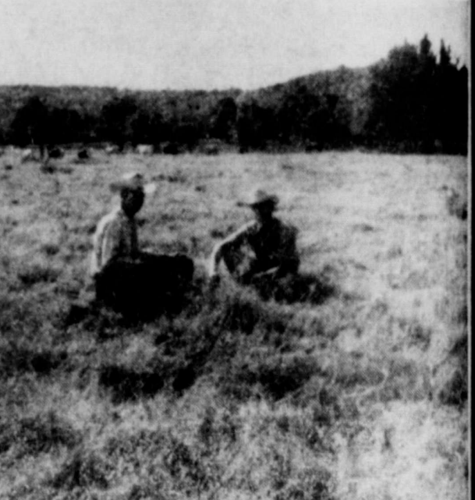
Service examine improved pasture of Coastal Bermuda.