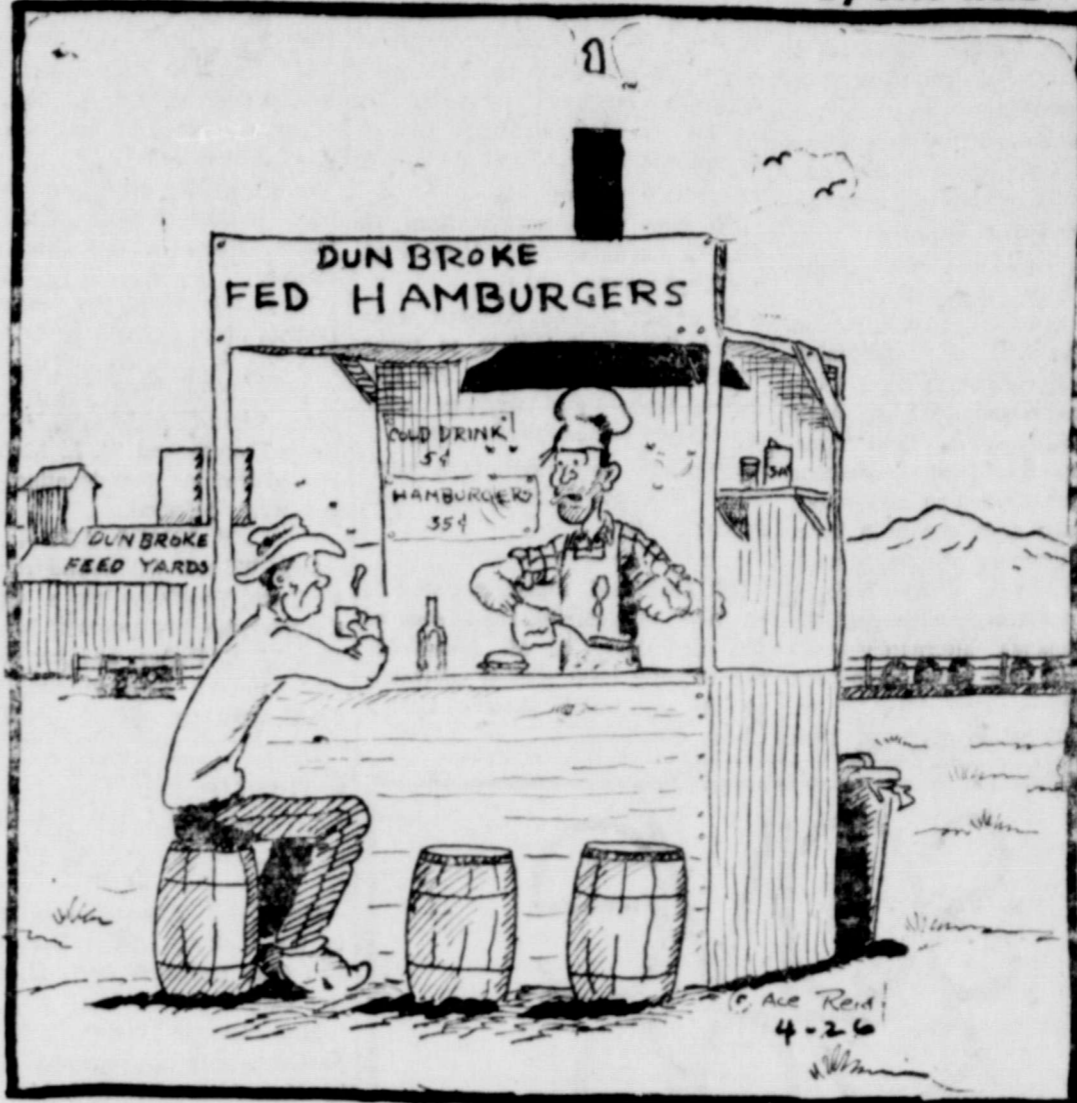
"Wul, I've got a real banker! He says if we can't sell these cattle in bigger chunks, we'll try it this way!"

not a problem on young corn and grain sorghum, are beginning to cause some damage in Hamilton County.