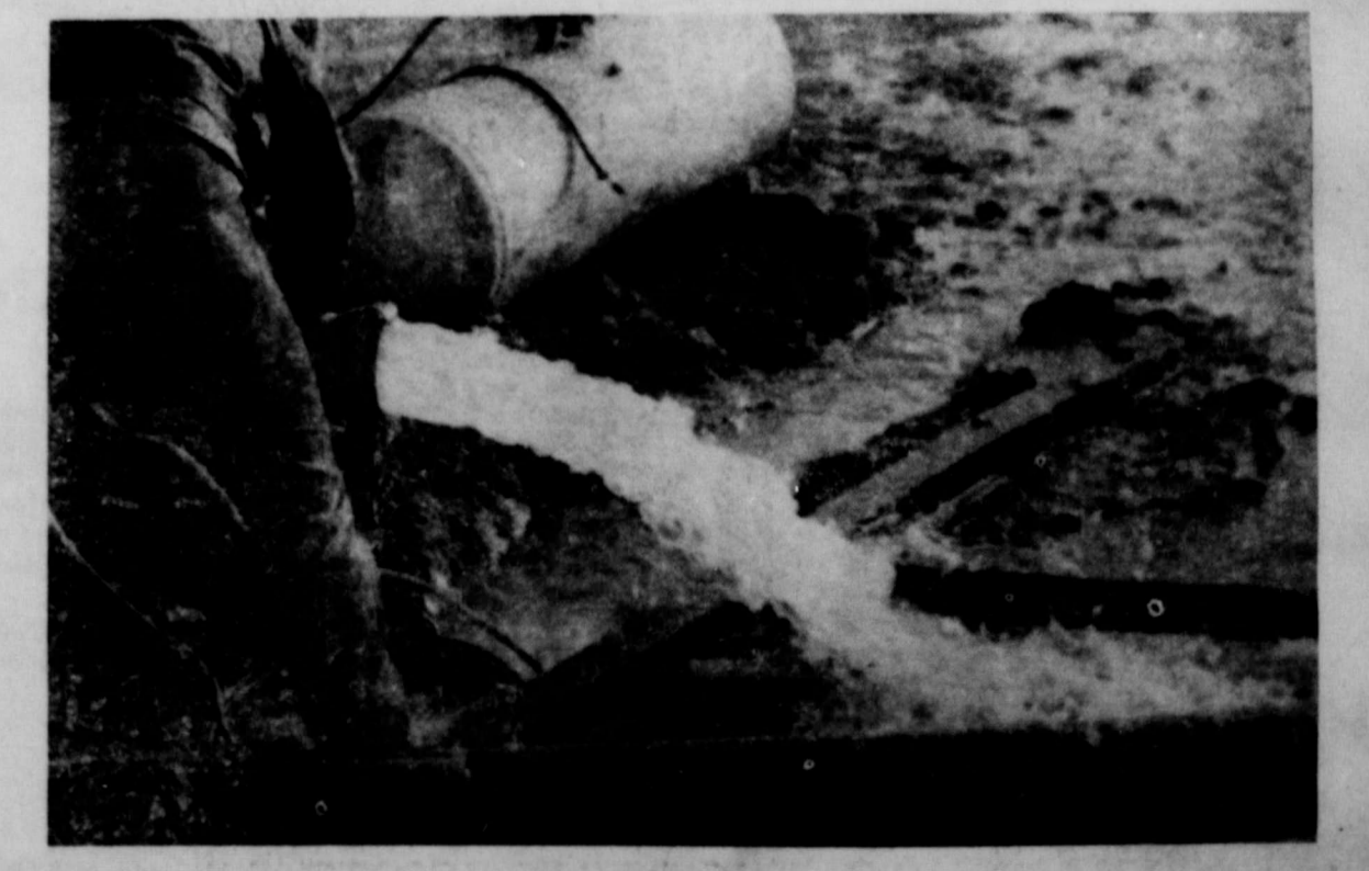
1,000 Gallon Irrigation Well.

Hico outsiders team has won six of eight games played this year.