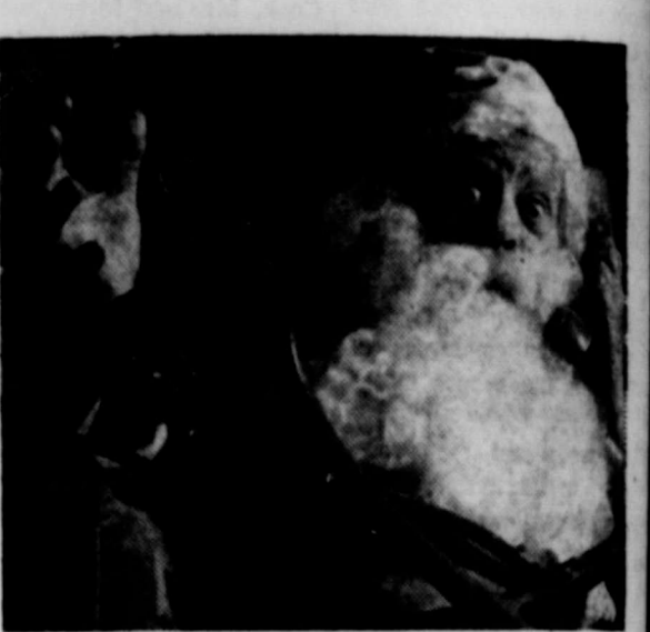
"I can't wait a week for a welding job."

Nothing takes the place of having a telephone handy. In the kitchen, upstairs, the playroom as well as by the fireplace. That's why an extension telephone makes such a perfect gift. Find out how easy it is to give a telephone for Christmas. Call us or come in.